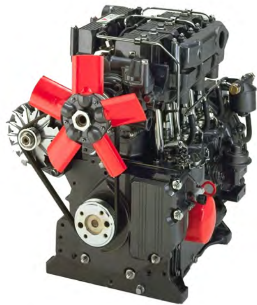
ALPHA SERIES ENGINE